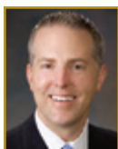
Mark A. Fahleson Law Institute

PRESENTED BY DRI's Cybersecurity and Data Privacy Committee IN CONJUNCTION WITH DRI's Government Enforcement and Corporate Compliance Committee